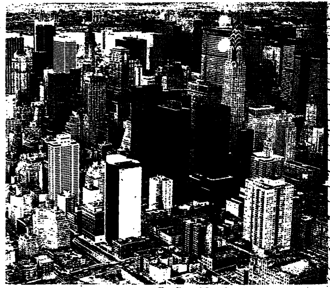
New York City walks financial tightrope.

NEW YORK (CSM) — New York City is once again on the tightrope.